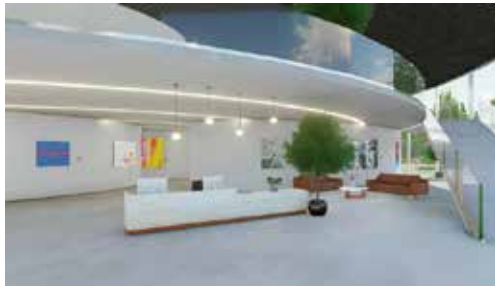
Entrance to the future meeting place "Museum"