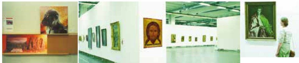
Stone Age and Voodoo Exhibition Picasso Dali Mondrian Russian Middle Ages El Greco

Patrons: Queen Sofia of Spain. Michael Gorbachev, Minister Dr Norbert Blüm Federal Republic of Germany