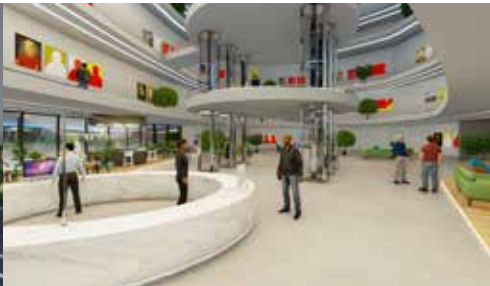
Lobby of the ***** Sterne Hotel