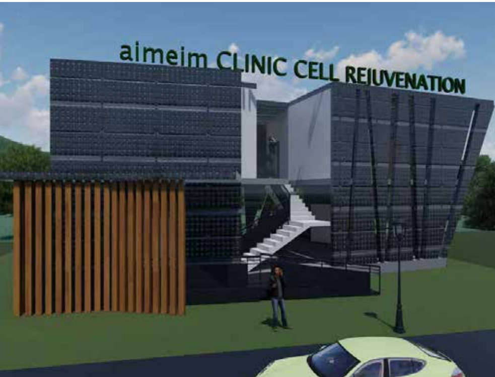
The world’s first aimeim clinic for cell rejuvenation from 10 to 40 years with medical care and the five and sixth sense appealing and activating individual information programmes of the aimeim system with naturopathic doctors, psychotherapists and holistic life counselling.

Other research results, e.g. from ETH Zurich in 2014, prove that “thoughts can activate genes”.