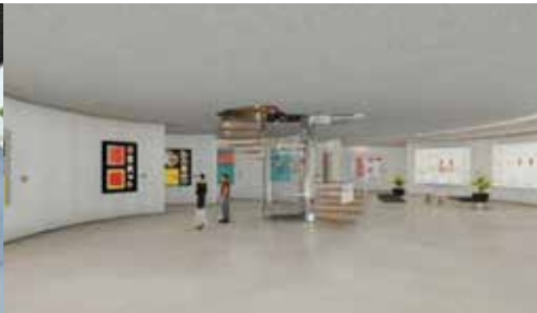
Museum with the exhibition area Formula of the Kunst del Arte