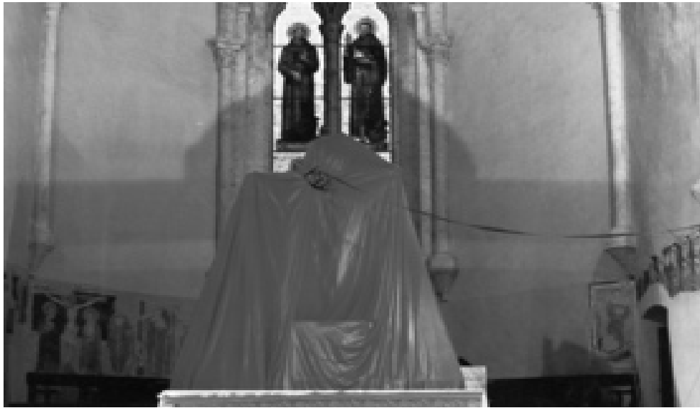
Title of the work: Information as Time or Timeless Events.

1991 “Pictures from the Perspective of God” in the Church of St. Francis in Gemini/Italy.