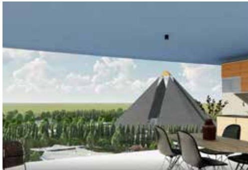
Smartloft luxury flats and villas by the 100 best architects and interior designers of the early 21st century as a total architectural work of art with sustainable service provision in the areas of water, climate and energy.