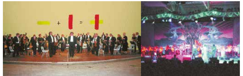
The opera "Mar" with the St. Petersburg Symphony Orchestra and the Techno, Rock-Pop Orchestra Monte Carlo / Stage design: Prof. Dr. Ernst Fuchs