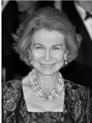
Reina Sofía de España