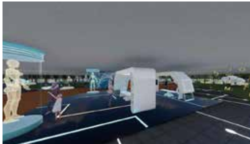
Innovation Marketplace: Assembly hall and Innovationsfabrik Innovation Marketplace