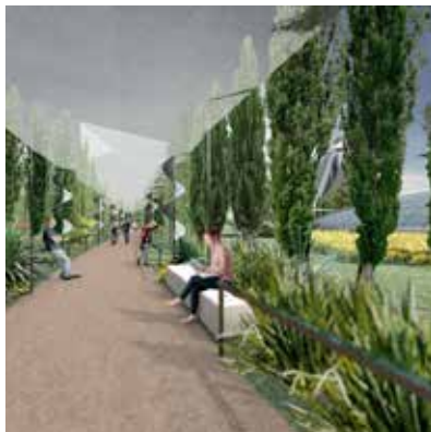
Park with energy flag mills Swimming pool Swimming, relaxation and sports landscape with cafeteria and restaurant