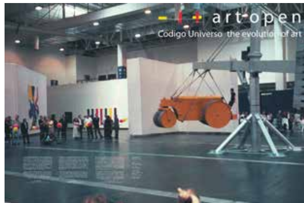
Special exhibitions : Giger, Fuchs, Christo, Contemporary Art, Liedtke

Sponsors included Coca Cola, the media group Bertelsmann, the Spanish Ministry of Culture and major museums and art collections in Europe with over 1000 original artworks worth billions of euros with an artwork rental price of over 20 million euros.