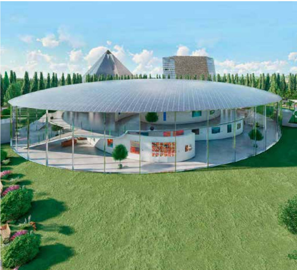
The Museum of the Evolution of Innovation in the Arts: architecture reminiscent of ancient Celtic skull rituals. The building is on an enlarged scale Albert Einstein’s skull plate- The evolution museum has 10 exhibition areas on 22 000 m2 of indoor and outdoor space.

The exhibition Nefor the development of innovations in art throughout the ages. The museum has the maÇscal shape of Albert Einstein’s skull plate, under which the artworks symbolise the synapses and the pathways the trajectories of the nerve connections, thus making it possible in the brain of the cultural history of mankind as well as in the brain of the patent office employee Albert Einstein to trace the innovations in art with the art formula