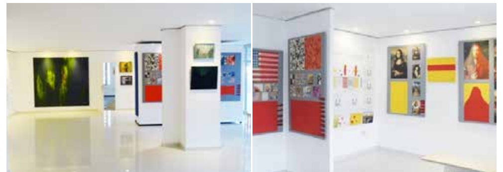
Liedtke Museum Exhibition: Art = Evolution

1994 Opening of the Liedtke Museum with the exhibition Art = Evolution