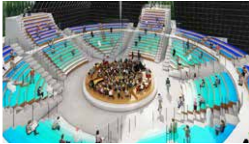
The Spirithall Pyramid as a Concert Hall