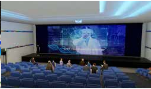
Seminar and Cell Rejuvenation Centre combines ancient Stonehenge rituals with epigenetics new information